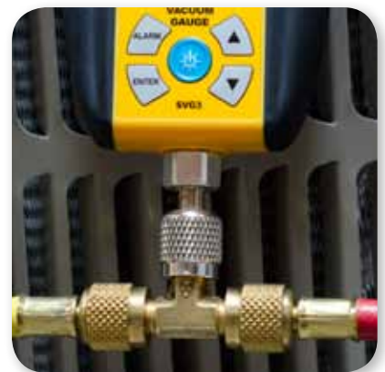
Traditional: In-line Between System and Vacuum Pump