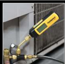
Vacuum Gauge JL3RHINT