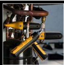
Pressure Probes JL3PRINT