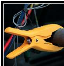
Pipe Clamps JL3PCINT JL3LCINT