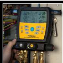
Digital Manifolds SM380VINT SM480VINT

Access a variety of Fieldpiece tools through the most advanced wireless system on the market today. Visit fieldpiecejoblink.com to sign up today!