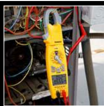
Clamp Meters SC480INT SC680INT