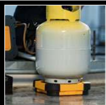
Refrigerant Scale SRS3